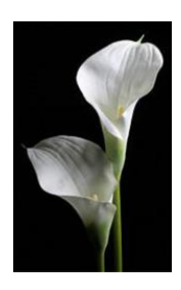
Psalm 41 R My soul is thirsting for God, the God of my life.

Like the deer that yearns For running streams, So my soul is yearning for you, my God. R